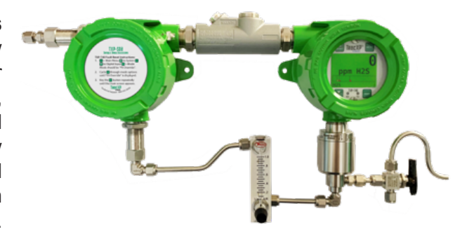
TXP-SDA Illustration may vary from actual final assembly